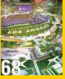
NFL Stadium Innovative entertainment stadium in Los Angeles