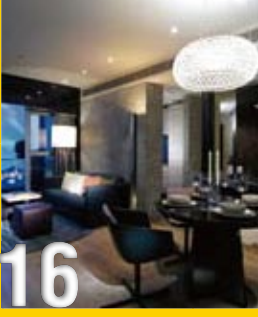
The Latitude Waterfront luxury residential towers to complete in late 2009