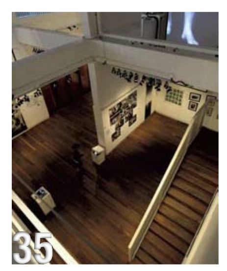
HKIA Annual Awards 2008 Outstanding architecture in and outside Hong Kong