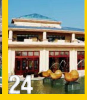
Hainan Clearwater Bay Large-scale resort and residential community