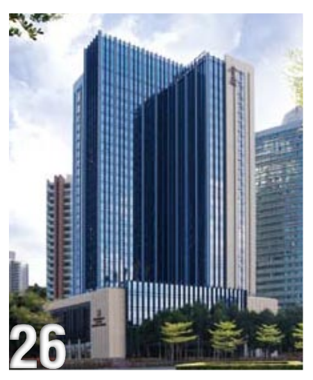
JW Marriott Shenzhen Luxury hotel design by Hirsch Bedner Associates