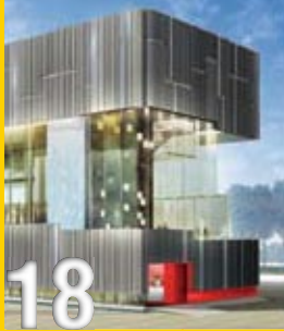
Hong Kong Pavilion for Expo 2010 Construction works started in Pudong, Shanghai