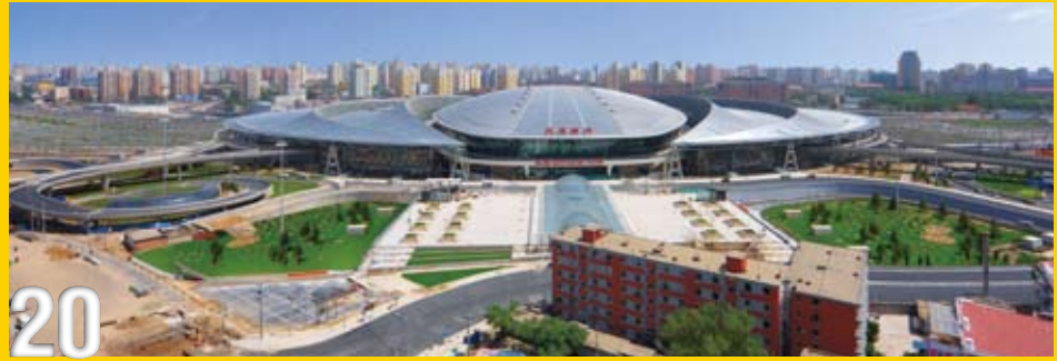
Beijing South Station Awarded the Beijing Contemporary Top Ten Architecture