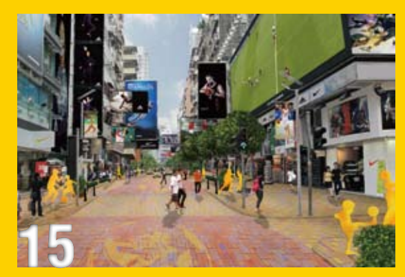
URA Mong Kok revitalisation plan HK$100 million streetscape improvement plan to commence in 2011

More than half-a-century of architectural design experience in Hong Kong