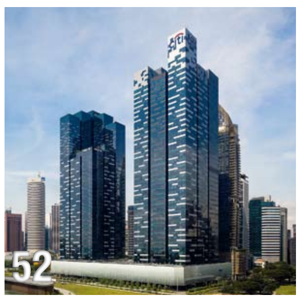
Westin Hotel, Singapore