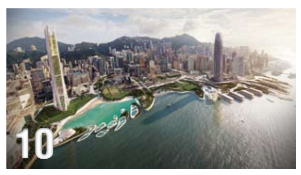
Redefining Hong Kong's waterfront