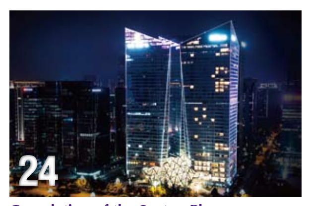
Completion of the Seaton Plaza