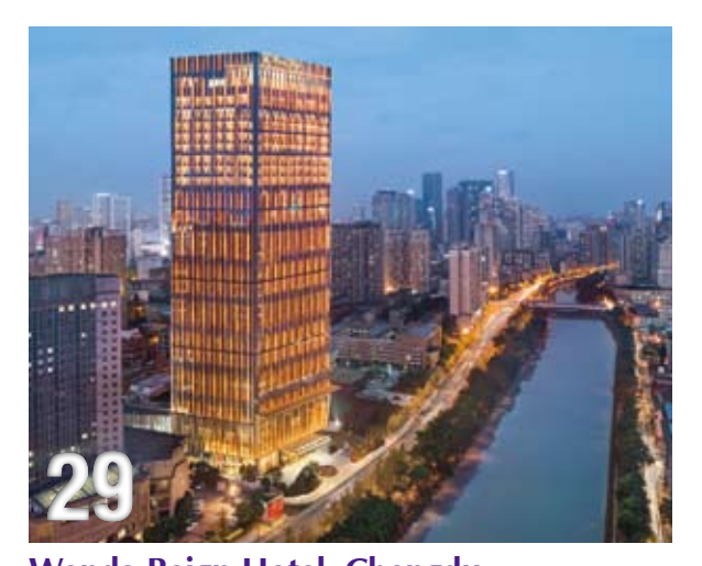
Wanda Reign Hotel, Chengdu