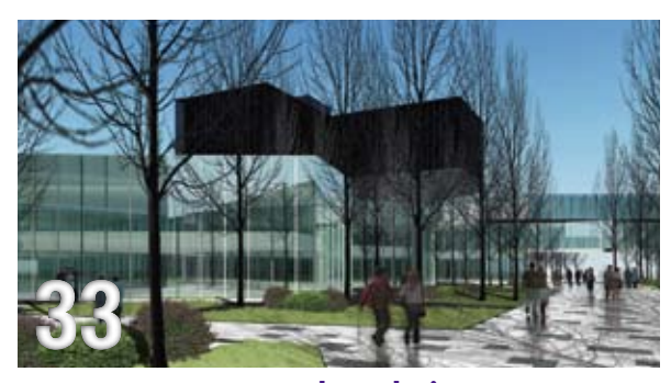
Data Base Center, Shanghai