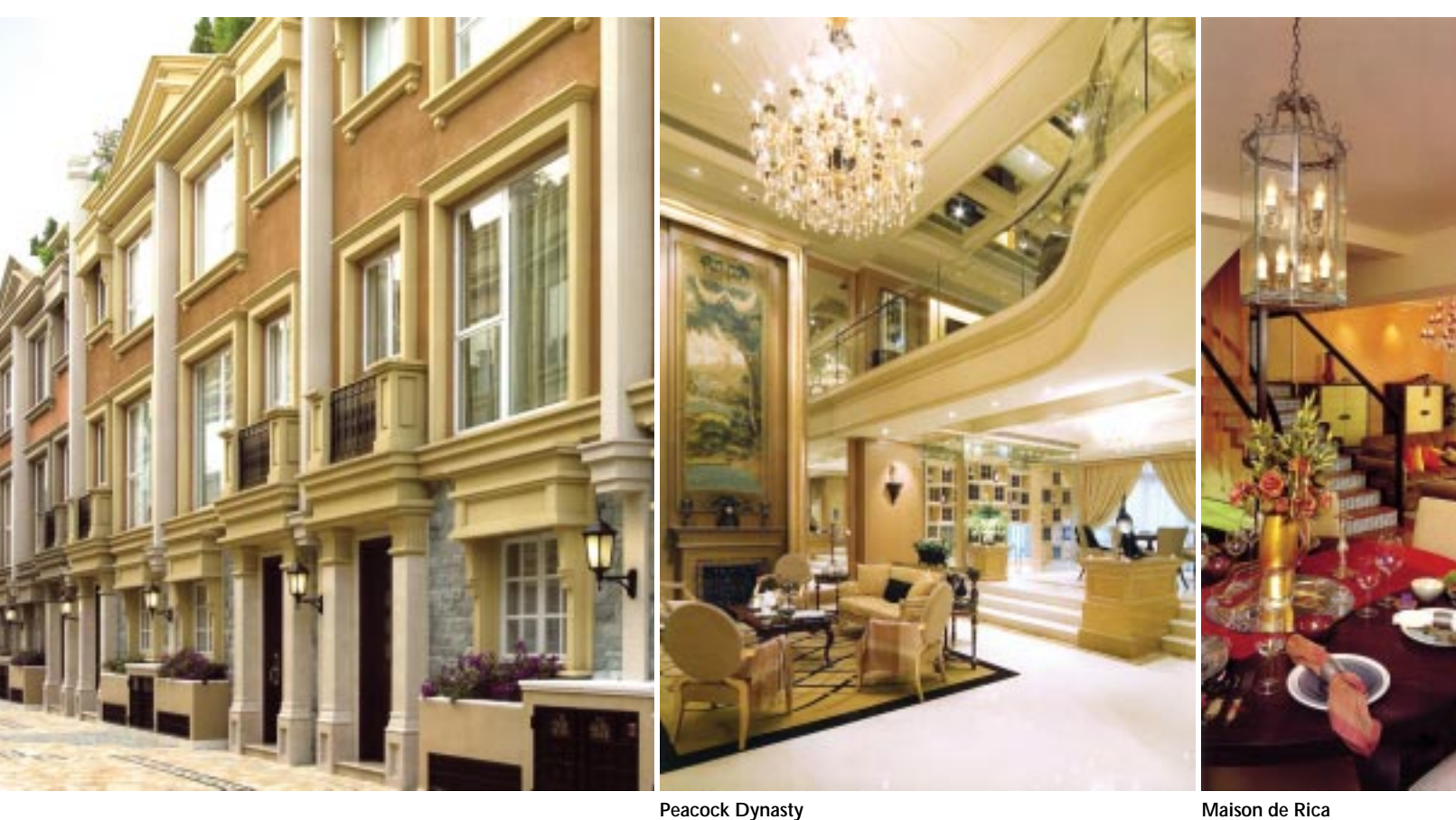
Maison de Rica House 178, Boulevard du Lac