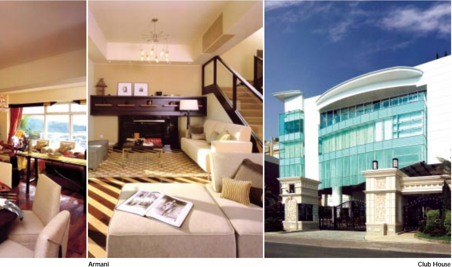
Armani House 73, Boulevard du Fontaine

along the lines of a Formula One racing circuit, and includes a garage, the pits, spectator stand, award podium and a rarely seen actual-size Formula One racing car. It is also equipped with a projection screen and an audio system to give children the feeling of being at a real Formula One racing circuit.