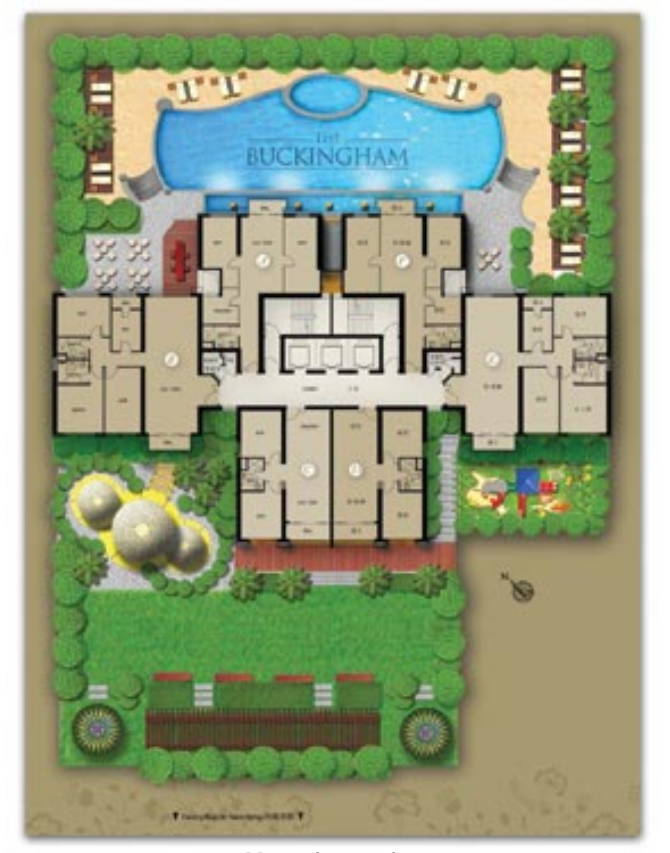
Master layout plan