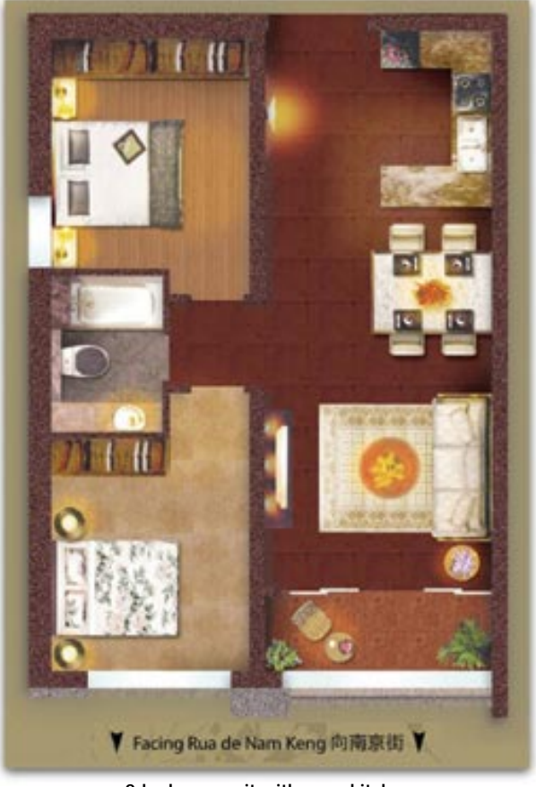
2-bedroom unit with open kitchen