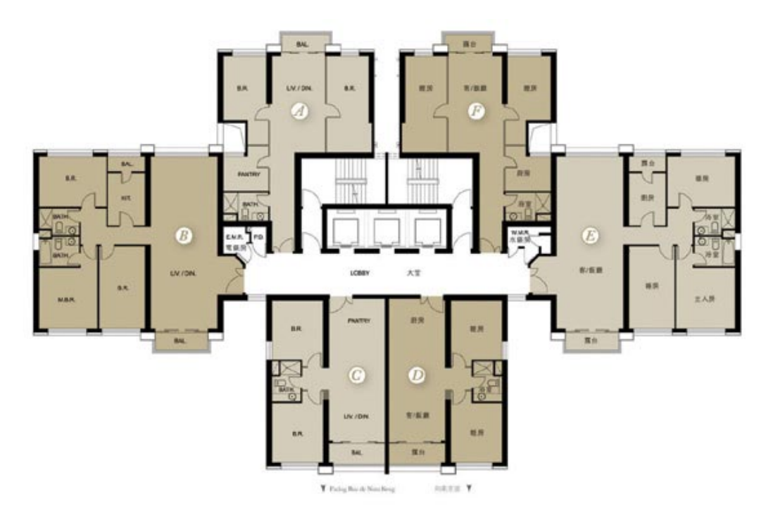
7th to 15th, 17th to 30th floor plan

treatments at the Queen Spa Fusion and outside a green landscaped Noble Emerald garden. Recreational facilities include an expansive swimming pool, a 6-star gymnasium, reading corner and children's outdoor playground. The wine and cigar bar, plus a deluxe banquet room and grand hall will be perfect for private parties.