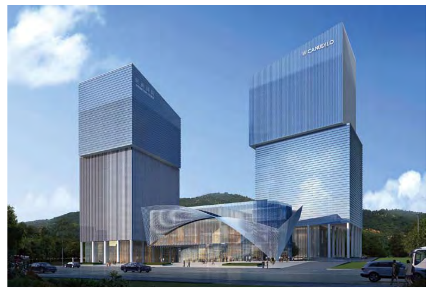
International Fashion Center