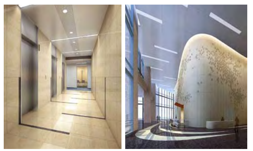
Eastern Harbor International Tower

Having won the Shanghai Yangpu Waterfront urban design competition in 2010, Heller Manus has now been awarded the architectural design contract for a project located on the Yangpu waterfront in Shanghai. The mixed-use, LEED-proposed project, primarily of residential and office uses, consists of two sites with a combined area of approximately 189,000 square meters. Also located in Shanghai, the Eastern Harbor International Tower, designed by HM, has recently opened and is the first LEED Gold high-rise in Shanghai.