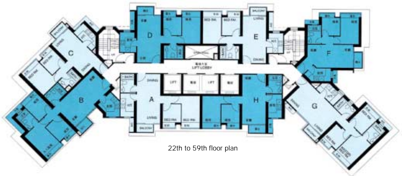
22th to 59th floor plan