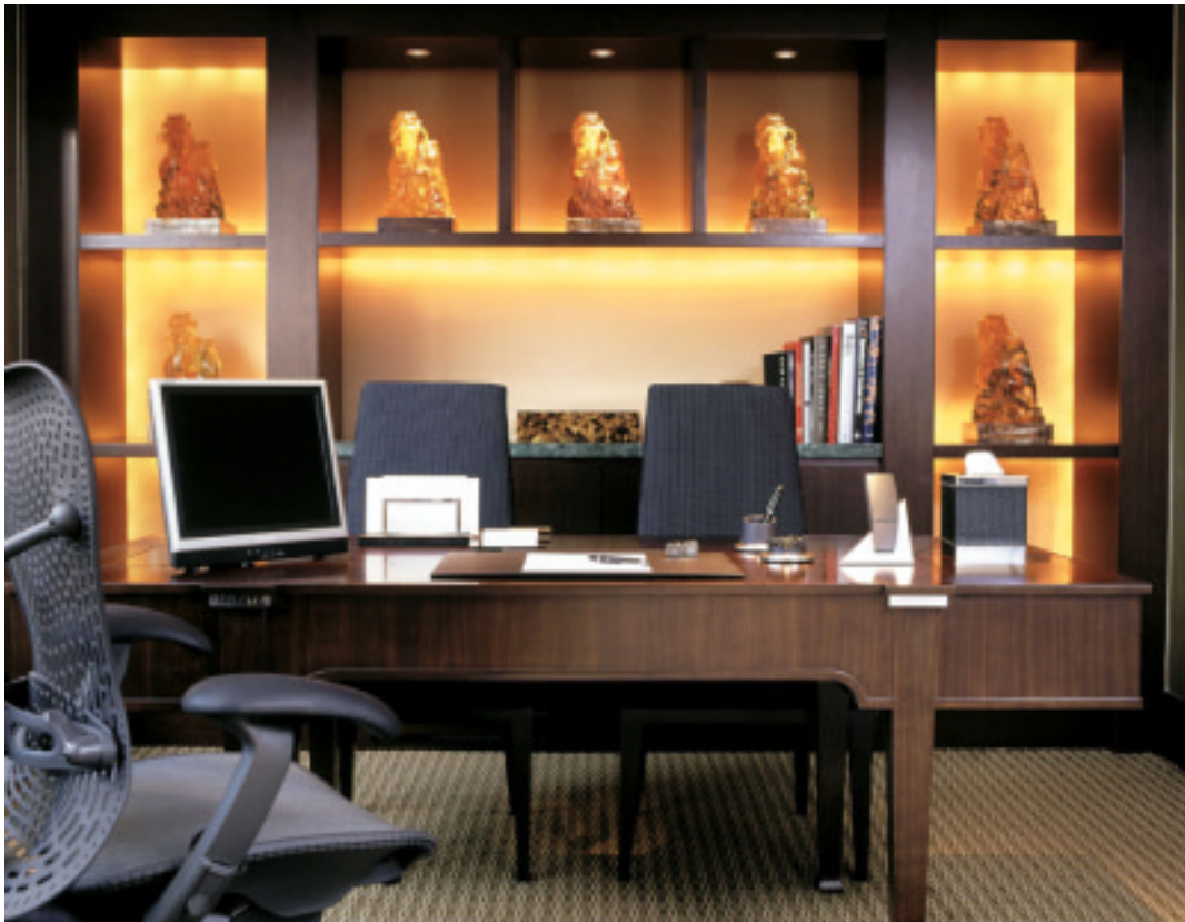
The Study: Custom-designed walnut wood desk and console table