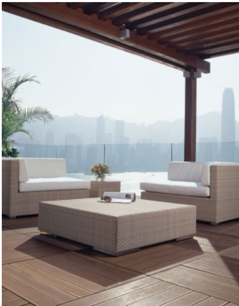
A pergola made of timber trellis provides shade and a cosy overhang for the dining table and lounge area