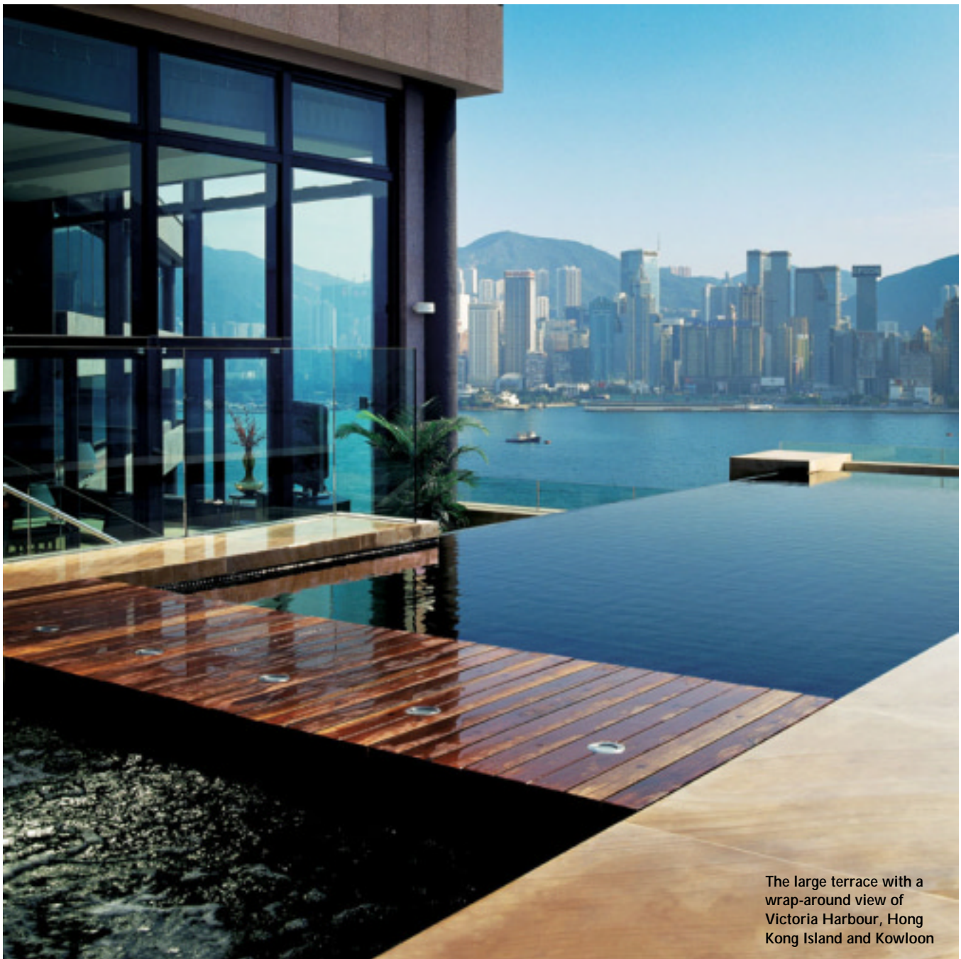
The large terrace with a wrap-around view of Victoria Harbour, Hong Kong Island and Kowloon