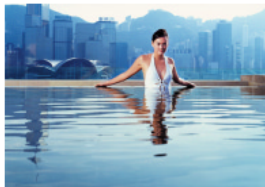
The Infinity swimming pool

glass door and window blinds for privacy.