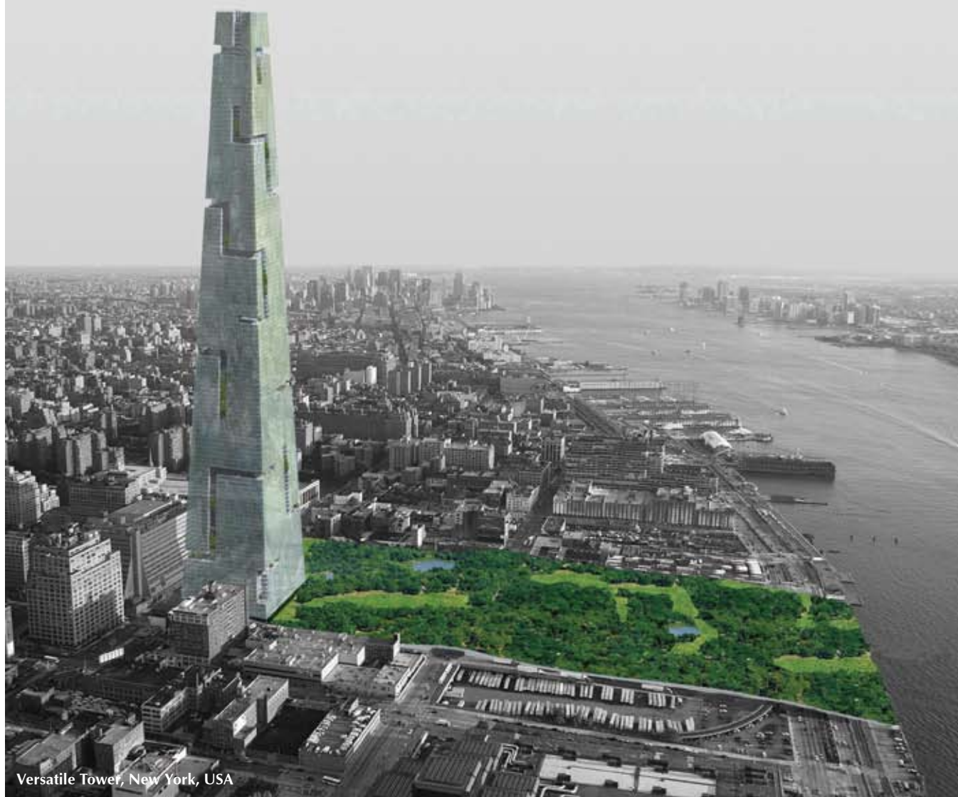
Versatile Tower, New York, USA

Mega cities like New York have very few open spaces left, and when they exist they are often occupied with major infrastructures. In this specific case, it is occupied with ground transportation that takes, every day, millions of people from a dense urban environment to their home or other getaway spaces.