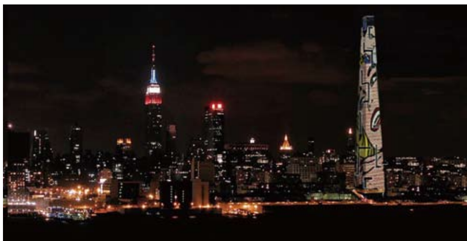
The illustration shows Versatile Tower displaying a Roy Lichtenstein exhibition opening at the MOMA

“ Its rational development creates West Park in the heart of the city. ”