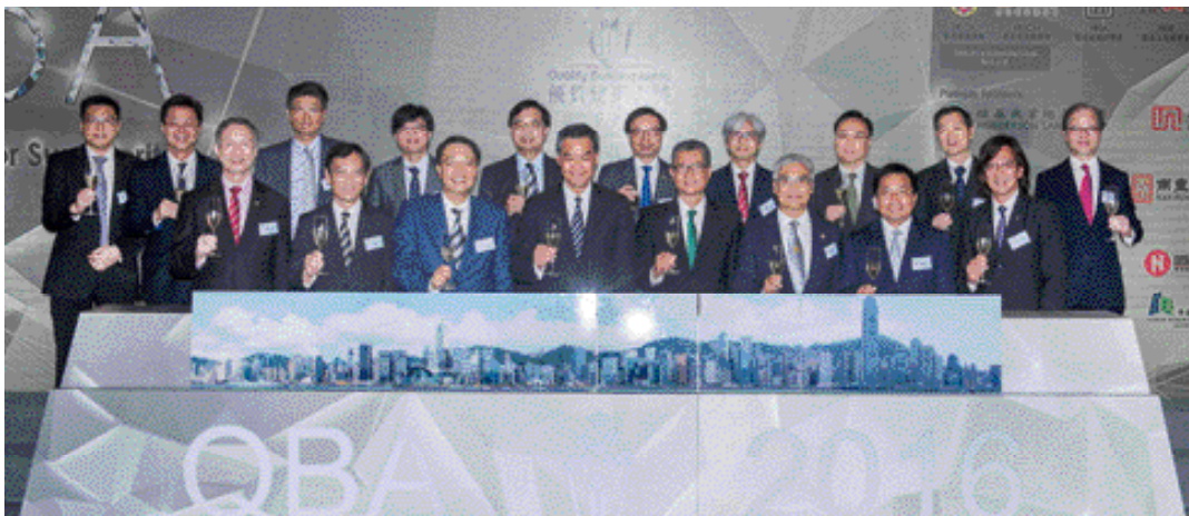
Mr Leung Chun Ying, Chief Executive of Hong Kong SAR, was the guest of honour at the QBA 2016 award presentation ceremony