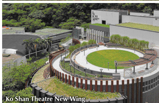
Ko Shan Theatre New Wing