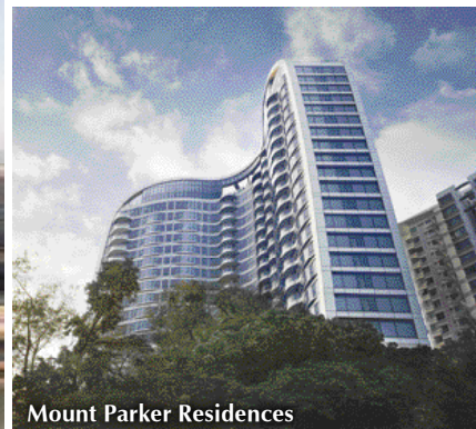
Mount Parker Residences