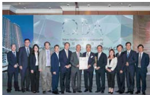
Hong Kong Residential (Single Building) Category – Grand Award Winner – Harmony Place