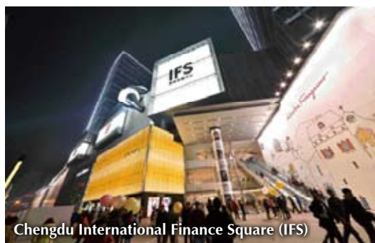
Chengdu International Finance Square (IFS)