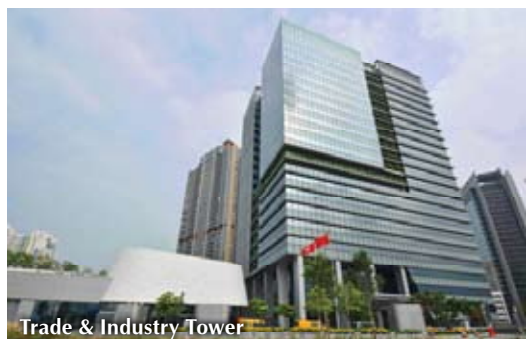
Trade &amp; Industry Tower