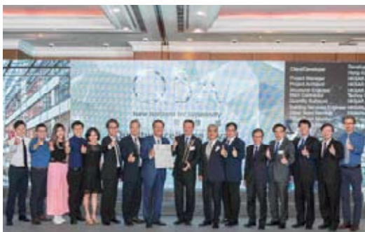
Quality Excellence Award – PMQ