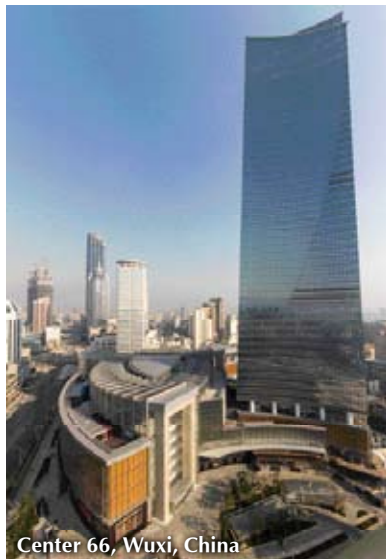
Center 66, Wuxi, China