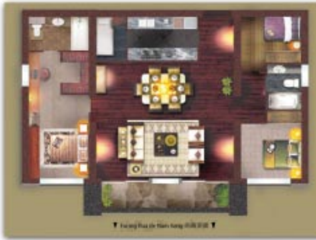
3-bedroom joint unit