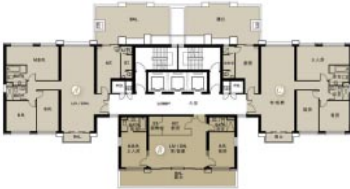
40th floor plan