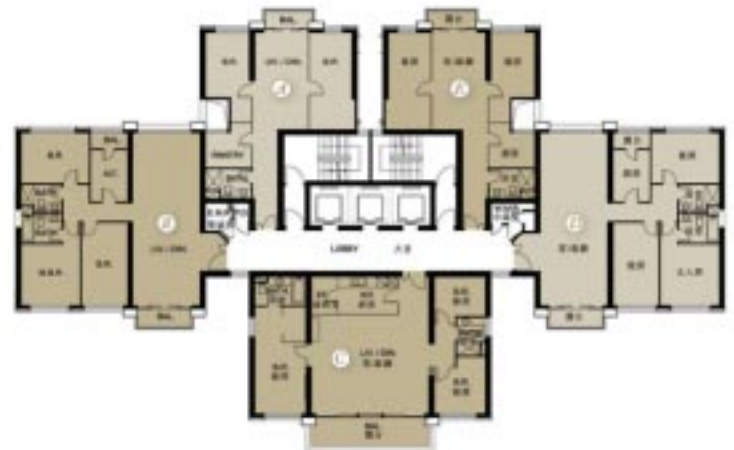
32nd to 36th floor plan