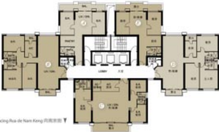
37th floor plan