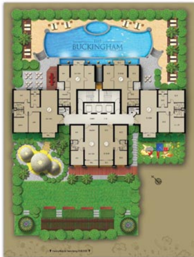
Master layout plan