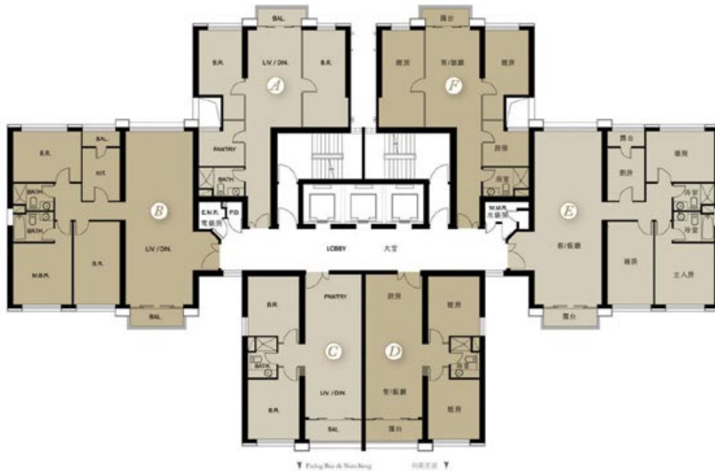
7th to 15th, 17th to 30th floor plan

treatments at the Queen Spa Fusion and outside a green landscaped Noble Emerald garden. Recreational facilities include an expansive swimming pool, a 6-star gymnasium, reading corner and children's outdoor playground. The wine and cigar bar, plus a deluxe banquet room and grand hall will be perfect for private parties.