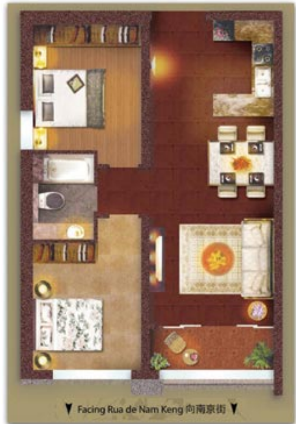
2-bedroom unit with open kitchen