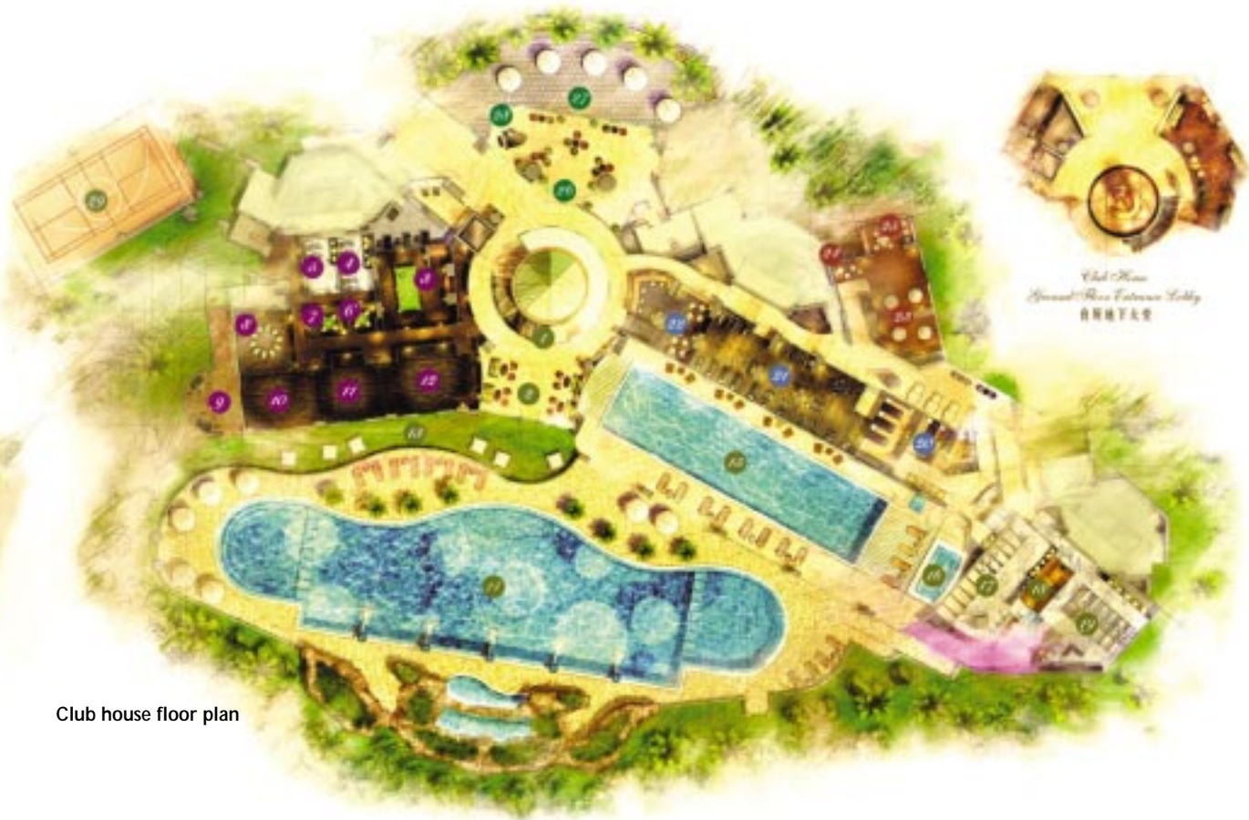
Club house floor plan