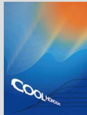
Publishing date: Third quarter 2009

To celebrate this special occasion, a series of activities have been subtly planned and professionally initiated to communicate our mission of advancing heating, ventilation, air conditioning and refrigeration (HVAC&R) technology to serve humanity and promote a sustainable world.